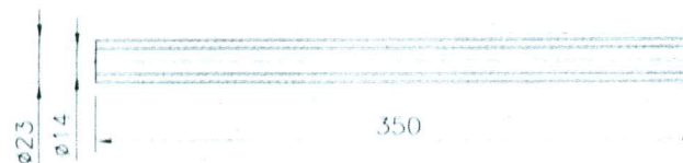
CERAMIC PIPE (MULLITE TUBE)