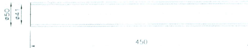
CERAMIC PIPE (MULLITE TUBE)